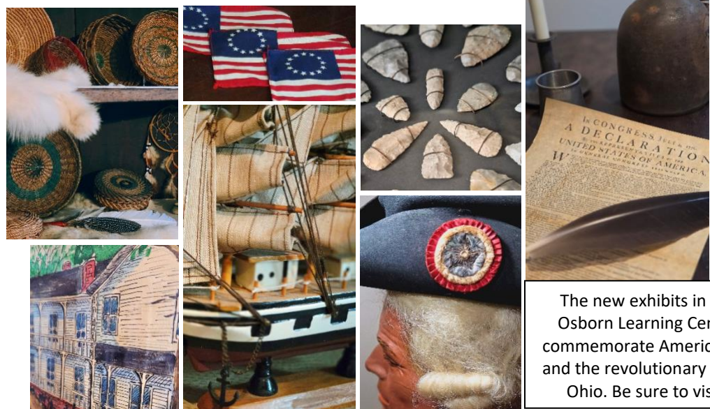
The new exhibits in the Osborn Learning Center commemorate America 250 and the revolutionary era in Ohio. Be sure to visit!