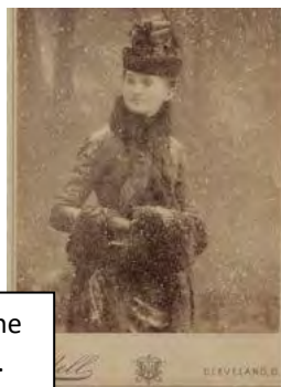
Winter portrait, circa the 1880s, 1999.P.04.011.

The speaker at this month's potluck, who I recently heard, is amazing. You don't want to miss her performance – she is one for the memory books! Hope to see you there.